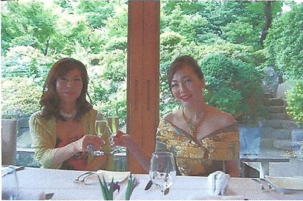
Yorozu Kimono Dress